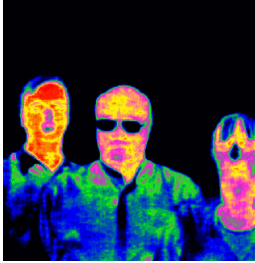
Figure 2 - An image from a commercial fever detection camera

The robot can be optionally equipped with an infrared thermometer for remote body temperature screening. When the robot moves around the place and meets people, it may detect if a person has a fever without touching the person.